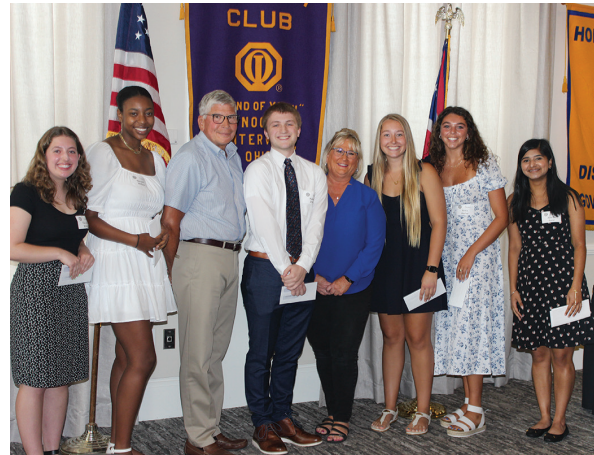
Previous Memorial Educational Assistance Award Winners

The $2,500.00 scholarship is renewable for a 2nd year with a continued financial need and a freshman grade point average of at least a 3.0.